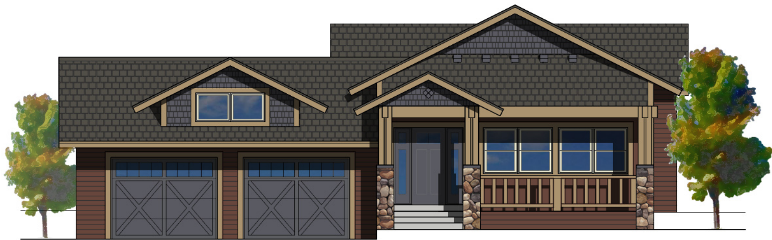
CONCEPTUAL RIM UNIT ELEVATION C SCALE: 3/16" = 1'-0" C2.1