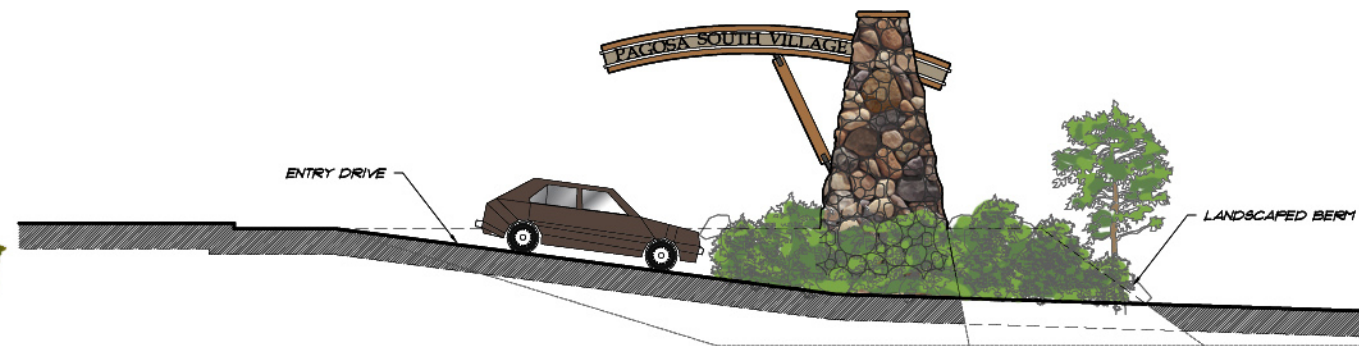
CONCEPTUAL ENTRY ELEVATION D SCALE: 3/16" = 1'-0" D2.1